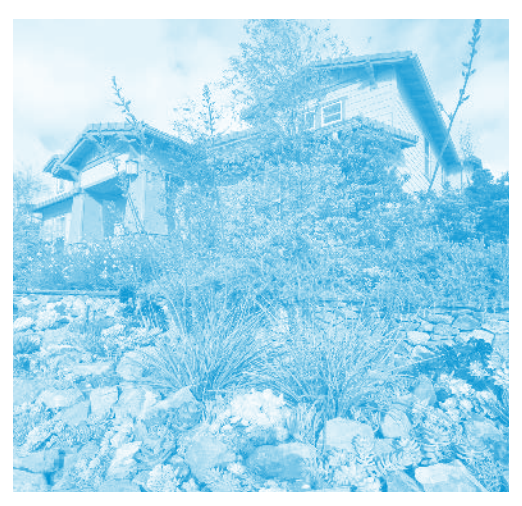
OMWD customers continue to embrace water-wise landscaping