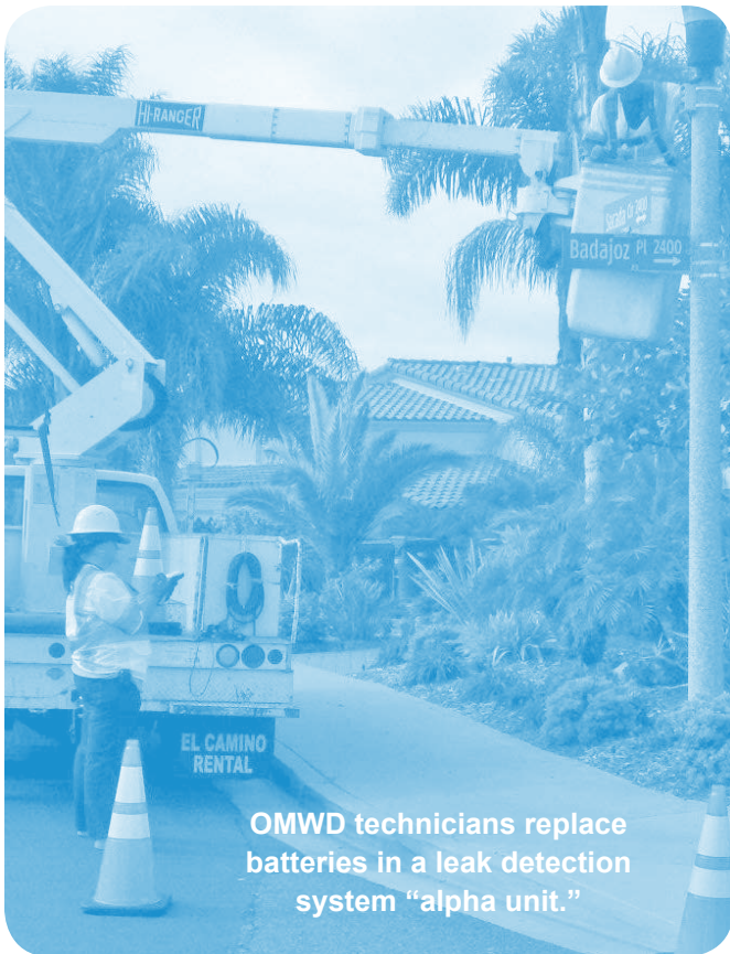
OMWD technicians replace batteries in a leak detection system "alpha unit."

OMWD takes a proactive approach to detecting leaks in our distribution system. One tool utilized by OMWD technicians is the Gutermann leak detection system. Individual listening devices send readings to "alpha units" in our service area, which can be queried on a personal computer via satellite. Specific sound frequencies can confirm the presence of a leak in OMWD's pipelines, in which case correlators can be installed to pinpoint the leak's location, minimizing costs associated with emergency repairs and reducing water loss.