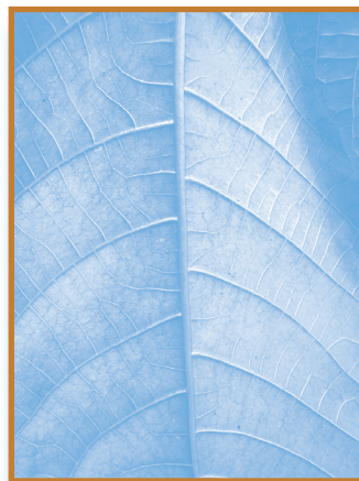
"Veins" Finn Behle Contest Winner, 2025