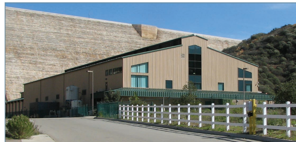
David C. McCollom Water Treatment Plant

DCMWTP is located within the northeastern portion of OMWD's service area and uses membrane technology to produce superior quality finished water. The membrane process uses fewer chemicals than conventional treatment methods, and offers improved barriers against pathogens, such as Cryptosporidium , viruses, and bacteria, such as coliform. Public tours of DCMWTP may be available; visit www.olivenhain.com/events for details.