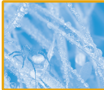
"Itsy Bitsy Momma" by Francis Bova People's Choice

OMWD is proud to operate Elfin Forest Recreational Reserve and holds an annual photo contest to help promote the recreational opportunities it offers and showcase the importance of protecting open space. Winners were chosen from nearly 100 entries in five categories, and EFRR Facebook followers also selected a People's Choice award winner. This year's winners are: