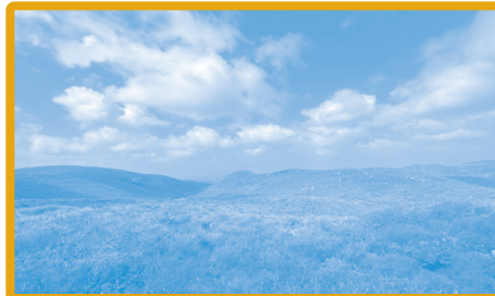
"Me-xal Overlook" by Jeff Shearer Scenic View