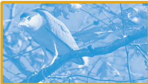
"Night Heron" by Kay Wood Animals