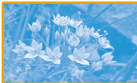
"Color Bloom" by Jaena Reyes Plants