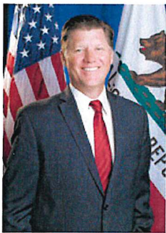
Sen. Brian W. Jones

District Office 7575 Metropolitan Drive, #100 San Diego, CA 92108 619-688-6700