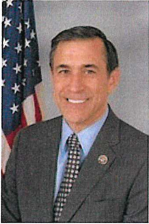
Rep. Darrell Issa