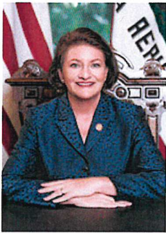
Sen. Toni G. Atkins

District Offices 24031 El Toro Road, Suite 201 Laguna Hills, CA 92653 949-598-5850 169 Saxony Road, Suite 103 Encinitas, CA 92024 760-642-0809