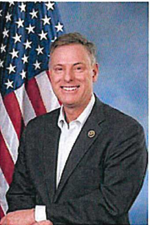
Rep. Scott Peters

District Office 2204 El Camino Real, #314 Oceanside, CA 92054 760-599-5000