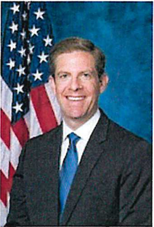
Rep. Mike Levin

District Office 221 W. Crest Street, #110 Escondido, CA 92025 760- 304-7575