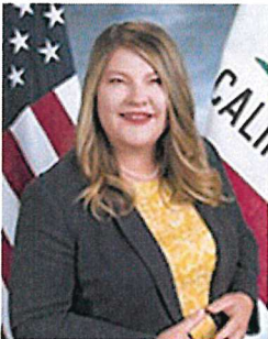
Amb. Tasha Boerner Horvath

District Office 12396 World Trade Drive, #118 San Diego, CA 92128 858-675-0760