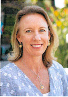
Sen. Catherine Blakespear

Capitol Office State Capitol, Room 7340 Sacramento, CA 95814-4900 916-651-4038