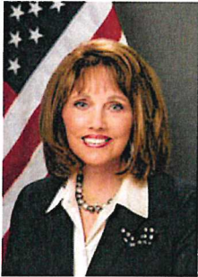
Sen. Patricia C. Bates

Capitol Office State Capitol, Room 3048 Sacramento, CA 95814-4900 916-651-4036