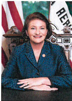
Sen. Toni G. Atkins

District Office 720 N. Broadway, Suite 110 Escondido, CA 92025 760-796-4655