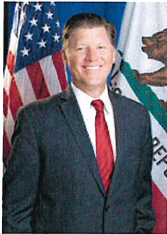
Sen. Brian W. Jones

District Office 169 Saxony Road, Suite 103 Encinitas, CA 92024 760-642-0809