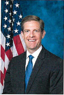
Rep. Mike Levin