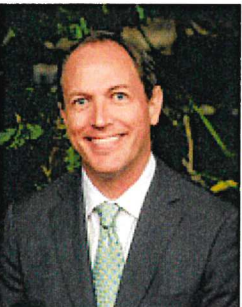
Amb. Brian Maienschein

District Office 1350 Front Street, Suite 6054 San Diego, CA 92101 619-645-3090