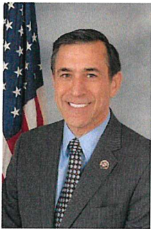
Rep. Darrell Issa

District Office 2204 El Camino Real Suite 314 Oceanside, CA 92054 760- 599-5000