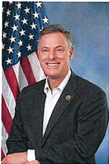
Rep. Scott Peters

District Office 570 Rancheros Road, #250 San Marcos, CA 92069 760-593-6116