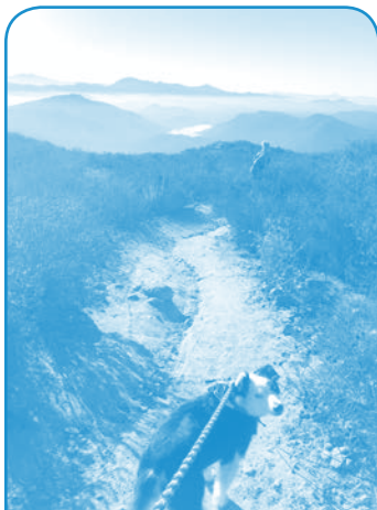
J. Brock "Morning Over Lake Hodges"

The natural beauty of the Reserve includes such native plant communities as oak riparian, oak woodland, coastal sage scrub, and chaparral. The Reserve's 11 miles of hiking, mountain biking, and equestrian trails also offer