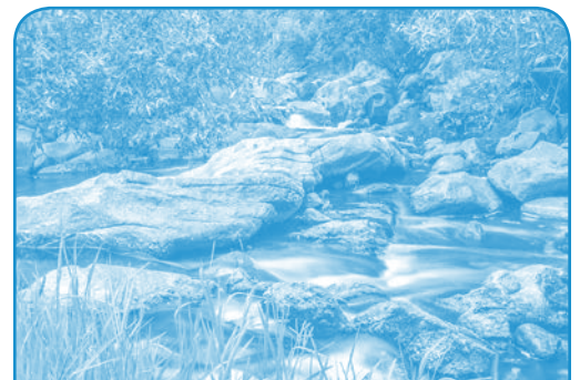
D. Humphrey "Behind the Grass"

Designed to be a fun and educational way to showcase the beauty at Elfin Forest Recreational Reserve, OMWD's annual photo contest runs through September 7, 2020. Winners will be selected from the categories of Water Scenery, Scenic View, Plants, Animals, Youth Photographer (age 15 and under), and People's Choice; photos will also be selected for the coveted Best in Show award.