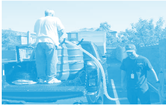
Fill station attendants will provide stickers for your water-tight containers once they have been approved.