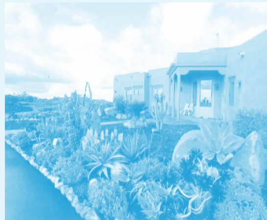
2015 California-Friendly Landscape Winner