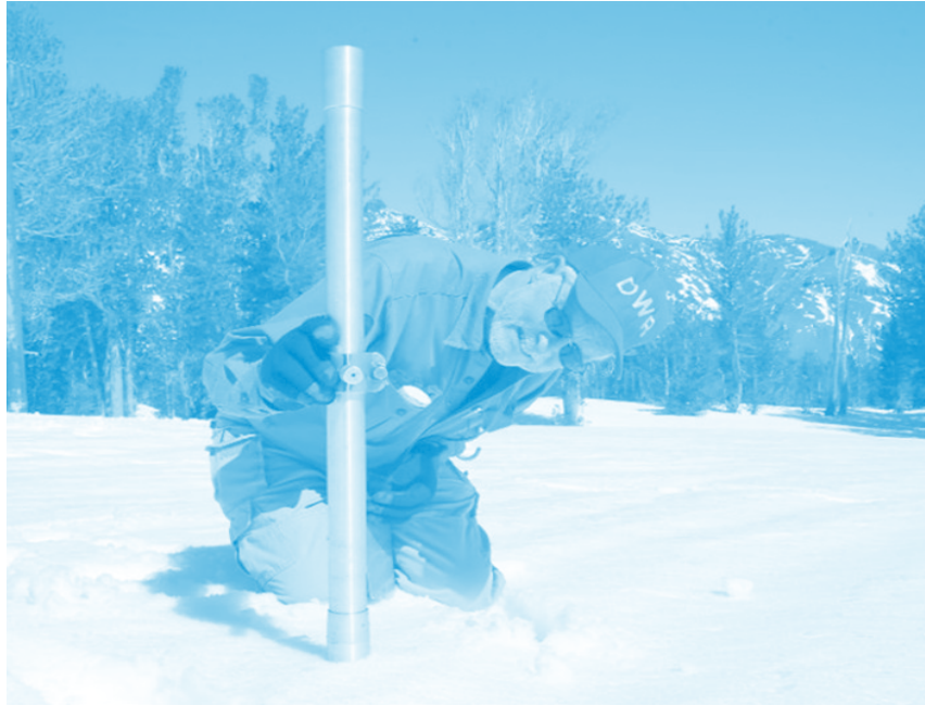
California's Department of Water Resources measures snowpack in the Sierra Nevada.

First, winter storms in February and March added billions of gallons to state reservoirs and several feet of much needed snow in the Sierra Nevada.