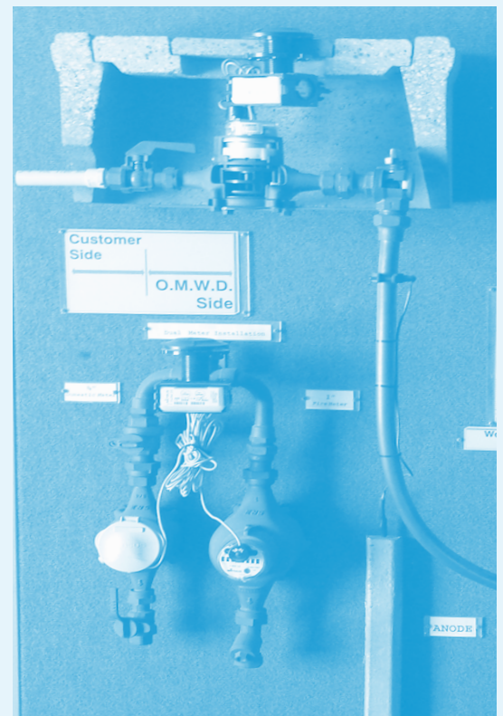
OMWD has a full-size meter display at its offices

OMWD is responsible for equipment leading up to your water meter, and the customer is responsible for all components beyond the ball valve on the water meter. Visit www.olivenhain.com/meter for information and videos on locating and reading your water meter, detecting leaks, and managing water pressure.