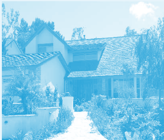
2014 California-Friendly Landscape Winner

OMWD customers are encouraged to enter the annual landscape contest to gain recognition for a yard that is both beautiful and water-efficient. The winner receives $250, is acknowledged at local ceremonies, and featured in OMWD publications. Hurry, the contest entry deadline is April 8! Visit www.landscapecontest.com for more information and an entry form.