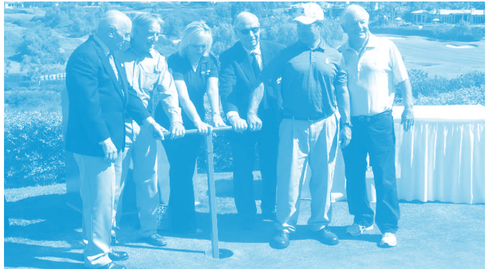
Commemorative valve-turning ceremony by OMWD and golf club officials in April 2015 marking flow of recycled water to Rancho Santa Fe Farms Golf Club.

RECYCLED WATER – In 2015, OMWD made a number of positive steps to improve recycled water availability for customers. In April, we converted the Rancho Santa Fe Farms Golf Club to recycled water.