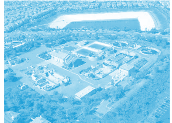
California Water Environment Association named our 4S Ranch Water Reclamation Facility its Plant of the Year

FINANCES – We were happy to receive a highly favorable AA+ bond rating from Standard & Poor's; this provided us with added flexibility to refinance our bonds, which saved ratepayers more than $3 million. Meanwhile, our board received yet another balanced budget, and we had our ninth straight year of net positive operating income. We continue to be recognized as one of the few San Diego County agencies that has kept rate increases in the single digits each year over the past nine years—we've done so through sound management, a focus on controlling costs, and utilizing an efficient workforce.